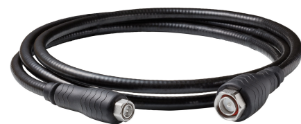
7MB43MBL12-0500FFP for EXAMPLE

Radio Frequency Systems' CELLFLEX® Factory-Fit Jumpers feature specially designed connectors which are soldered-on in a strictly controlled industrial process to ensure industry leading performance for today's high-performance wireless systems. The connector design and manufacturing process has been optimized to produce premium VSWR and IM levels. Injection molded boots provide reliable and repeatable additional sealing level and strain relief. Our facilities produce and stock all popular lengths as required by the industry, and can deliver custom lengths with premium VSWR and IM levels on request.