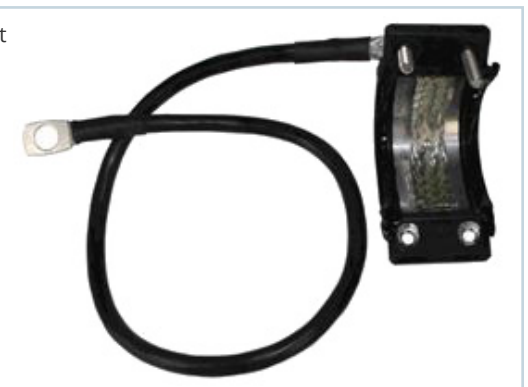
GKSPEED20-78P shown for illustration